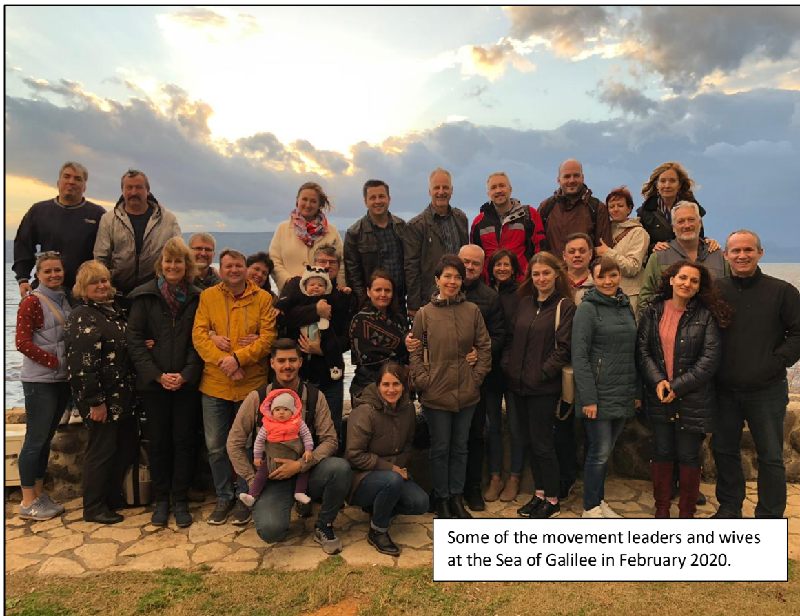
Some of the movement leaders and wives at the Sea of Galilee in February 2020.